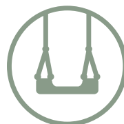
Plastic Swing Seat