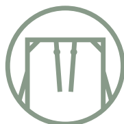
Single Swing Gantry