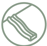
Slide - All Plastic