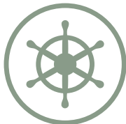
Steering Wheel - Boat