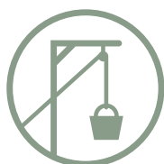
Pulley with Basket