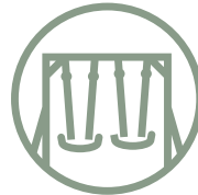
Double Swing Gantry