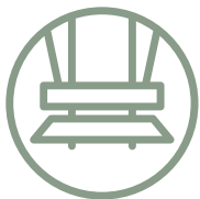
Hanging Swing Seat (3ft)