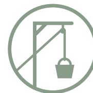
Pulley with Basket