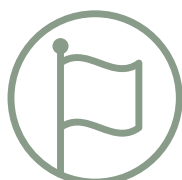
Flag Pole - Static with Flag